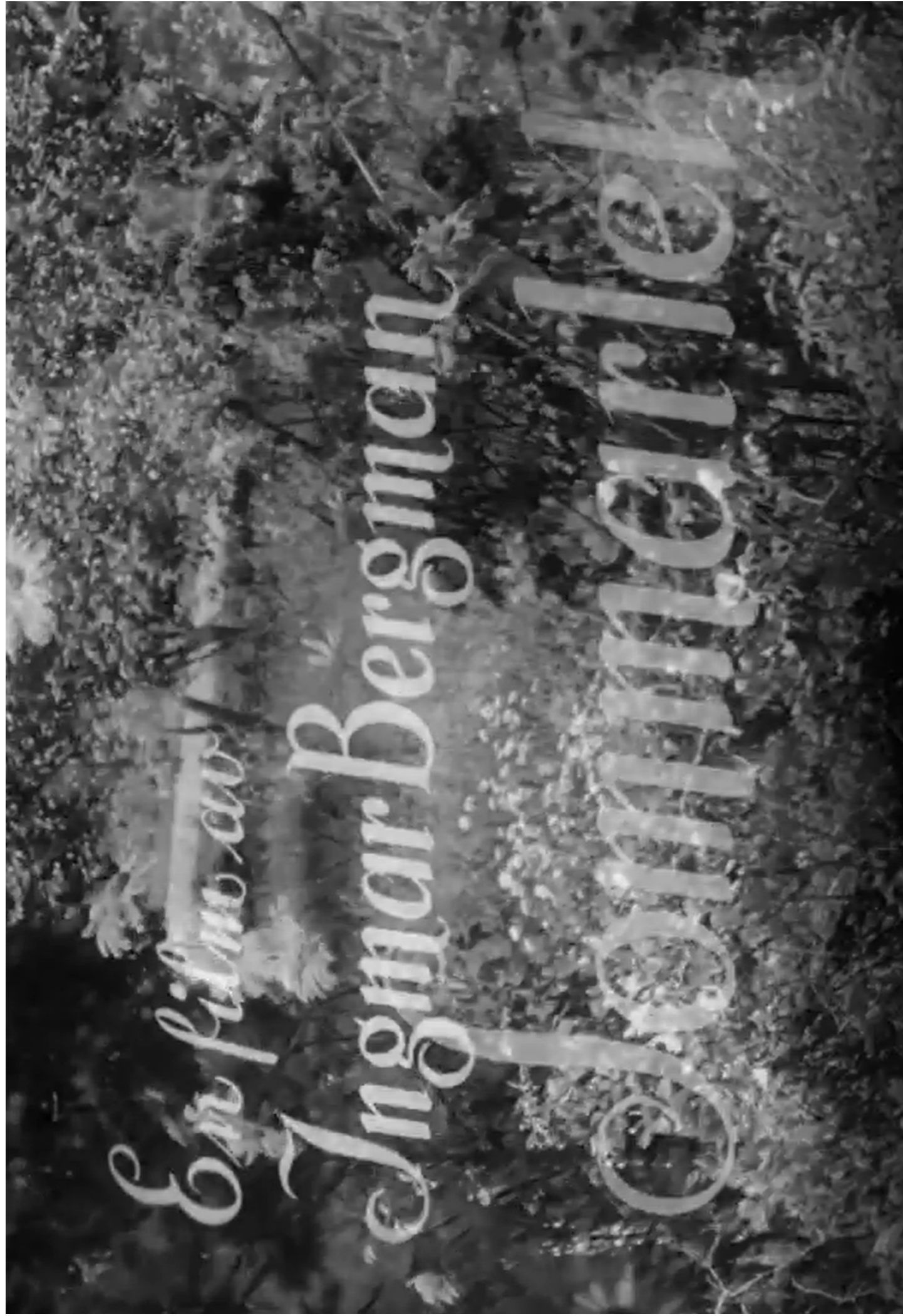
IMAGE N°3 – STILL FROM INTRO “SUMMER INTERLUDE” BY INGMAR BERGMAN 1951