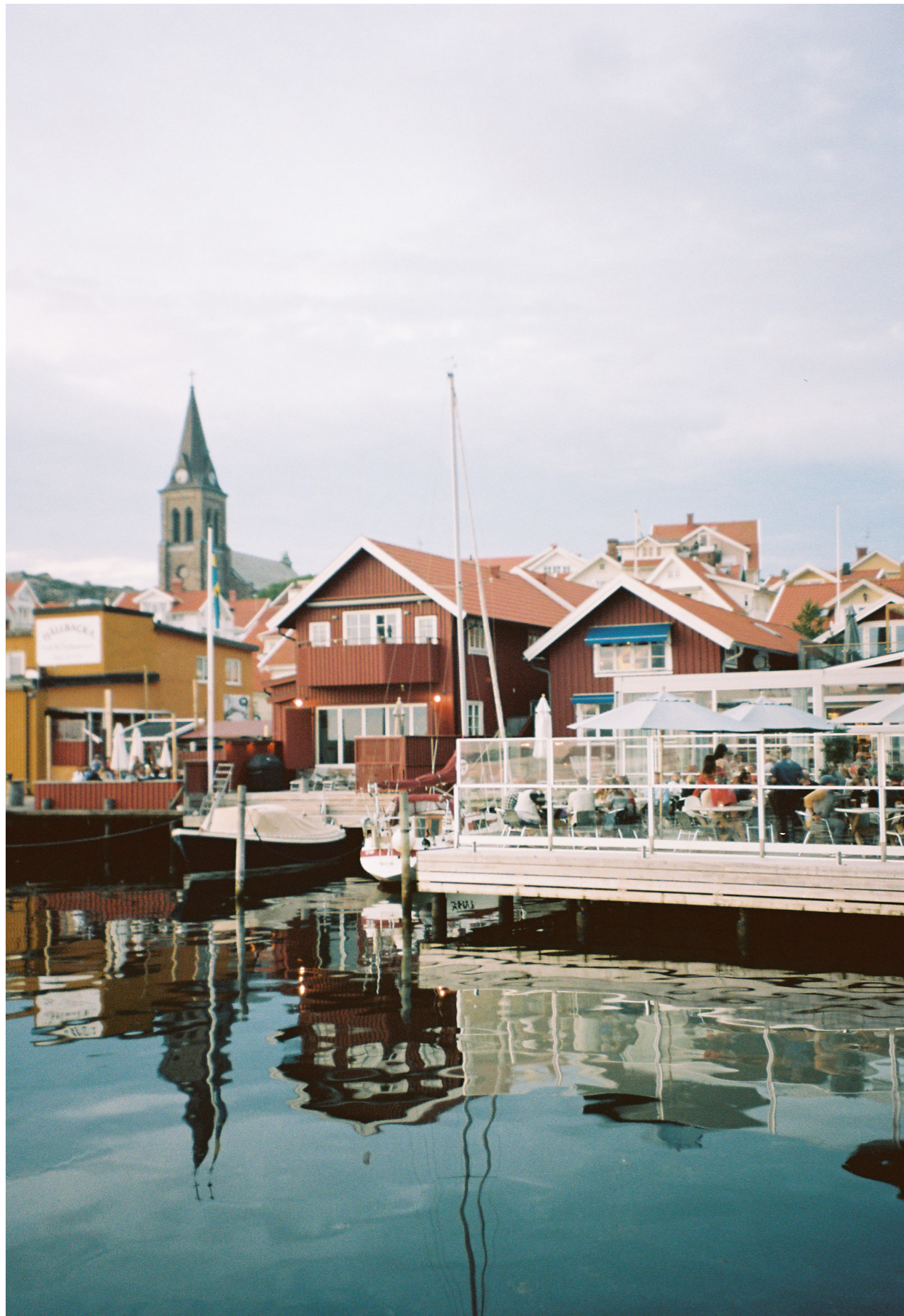
IMAGE N°10 – ANALOGUE PHOTO OF FJÄLLBACKA HARBOUR, ONE OF MANY POPULAR SUMMER VILLAGES ON THE SWEDISH WEST COAST. 2022