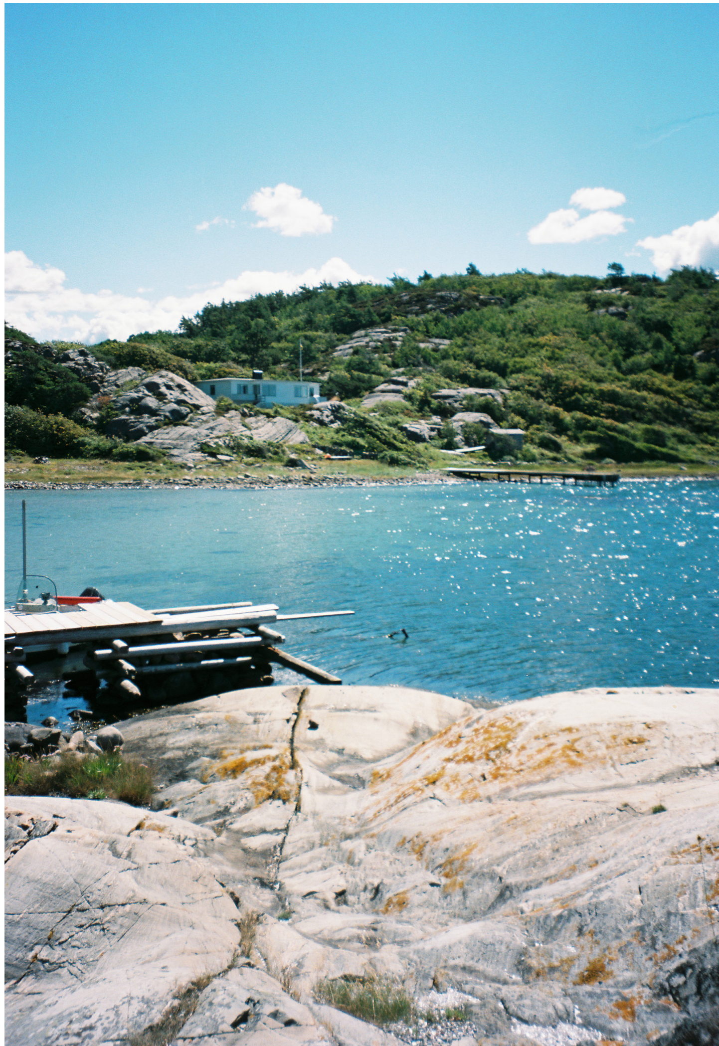
IMAGE N°8 – ANALOGUE PHOTO OF A SECOND HOME AT LÖVÖN, KODE, WEST COAST SWEDEN