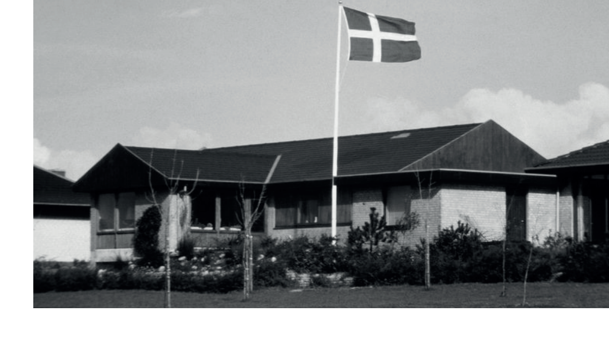
in a parcel house'